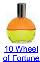
10 Wheel of Fortune

In the never ending circle of the Yin/Yang which represents the circle of life, olive is coming out of the darkness into the light, from rest to the beginning of movement (see arrow on diagram). This point on the never ending circle is just after the stillpoint when there is no movement, no breath, somewhere between light and dark where there is only neutrality . Movement begins slowly at the point of olive green and then reaches it's zenith at the Summer Solstice.